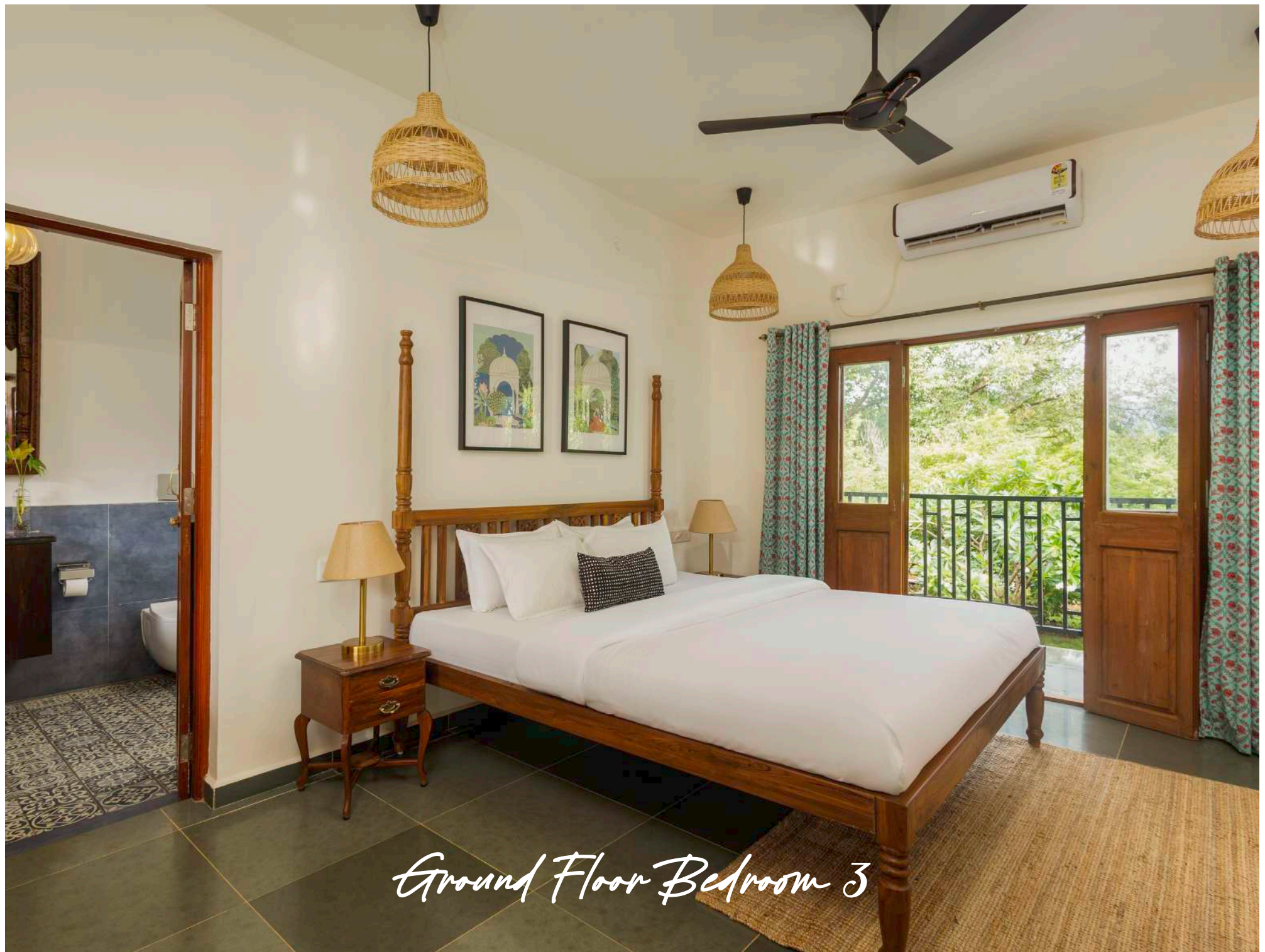
Ground Floor Bedroom 3