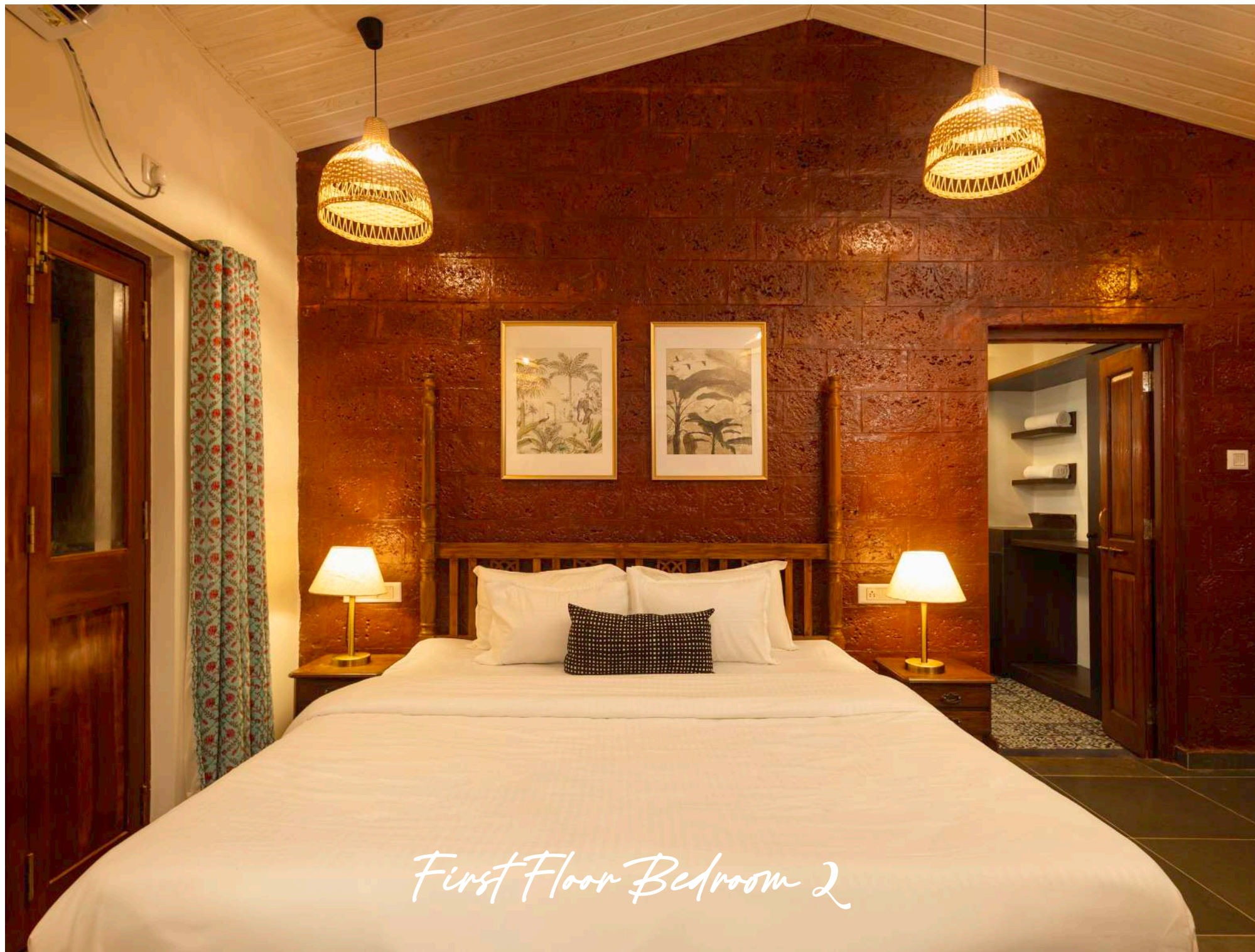
First Floor Bedroom 2