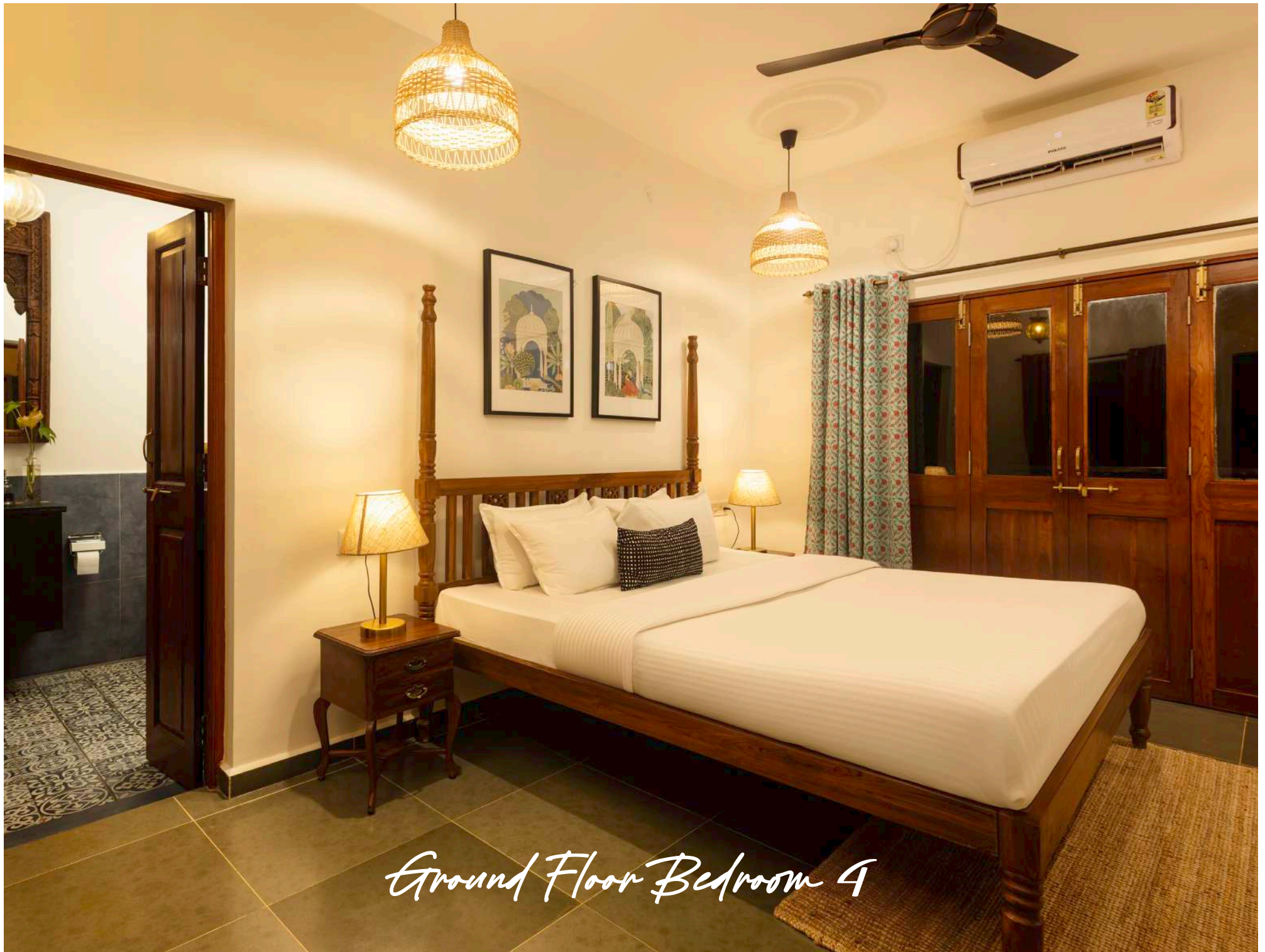
Ground Floor Bedroom 4