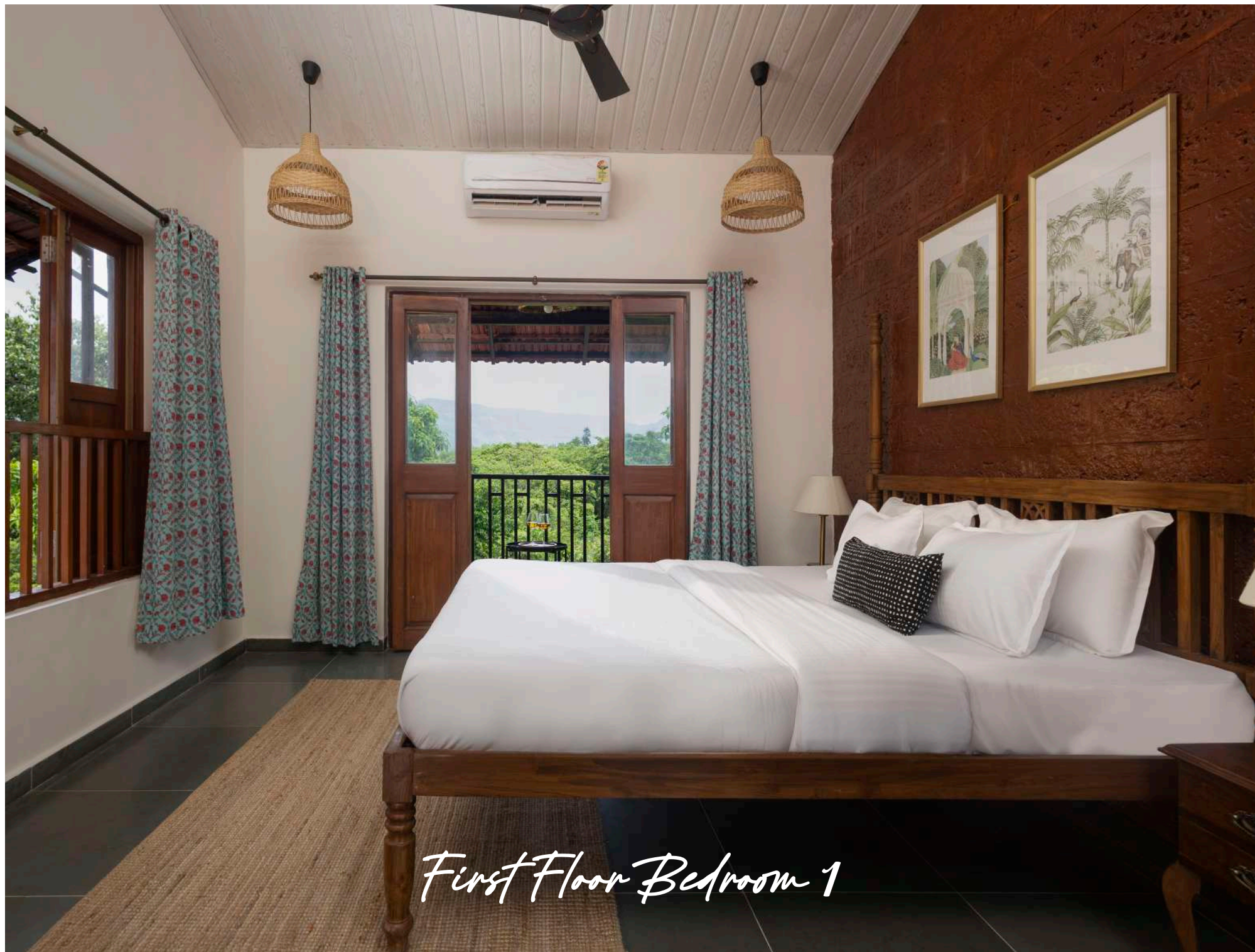
First Floor Bedroom 1